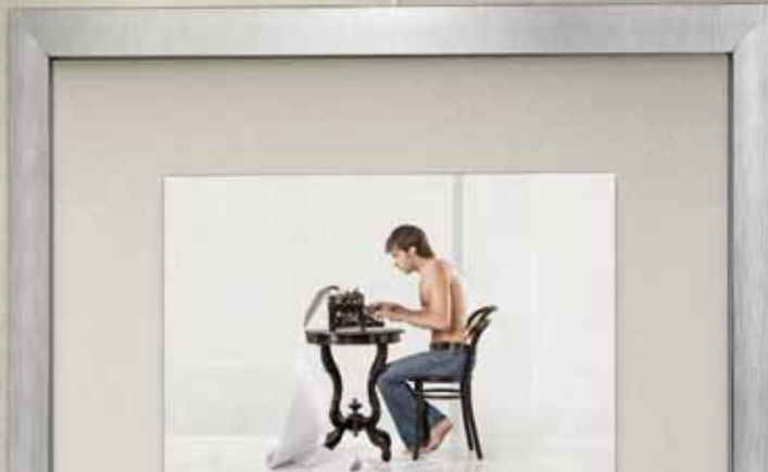
MAXIMUM LOAD 50 KG/M

NEW 2010: COMBI RAIL PRO-LIGHT Easy installation High Performance