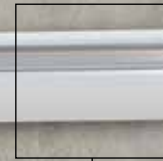
LOAD CAPACITY UP TO 300W