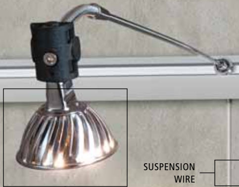
LED LIGHTING AND HALOGEN LIGHTING BOTH POSSIBLE